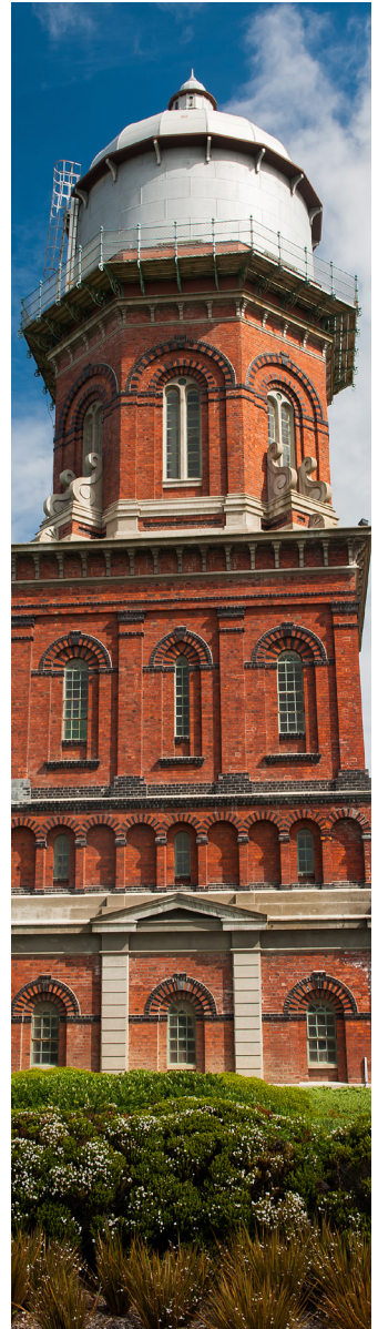
Water Tower, Invercargill

Our Property Management team has over 15 years experience, we are specialists when it comes to managing investment properties in Southland.