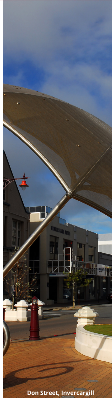
Don Street, Invercargill